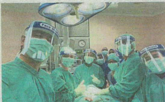
In his element: Dr Noor Hisham and his operating theatre staff.