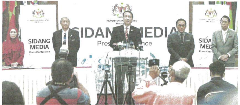
Dr Noor Hisham Abdullah pada sidang media harian berkaitan jangkitan COVID-19 di Putrajaya, semalam

"Perincian bagi tiga kes dalam kalangan warganegara berkenaan ialah masing-masing satu kes dari saringan kontak kepada kes positif di Wilayah Persekutuan Kuala Lumpur, kes saringan pusat